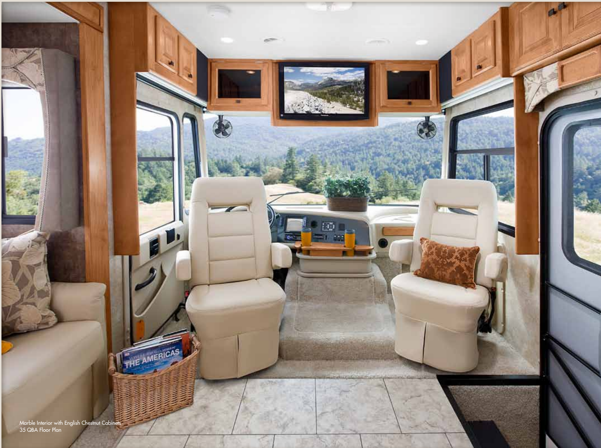
Marble Interior with English Chestnut Cabinets 35 QBA Floor Plan