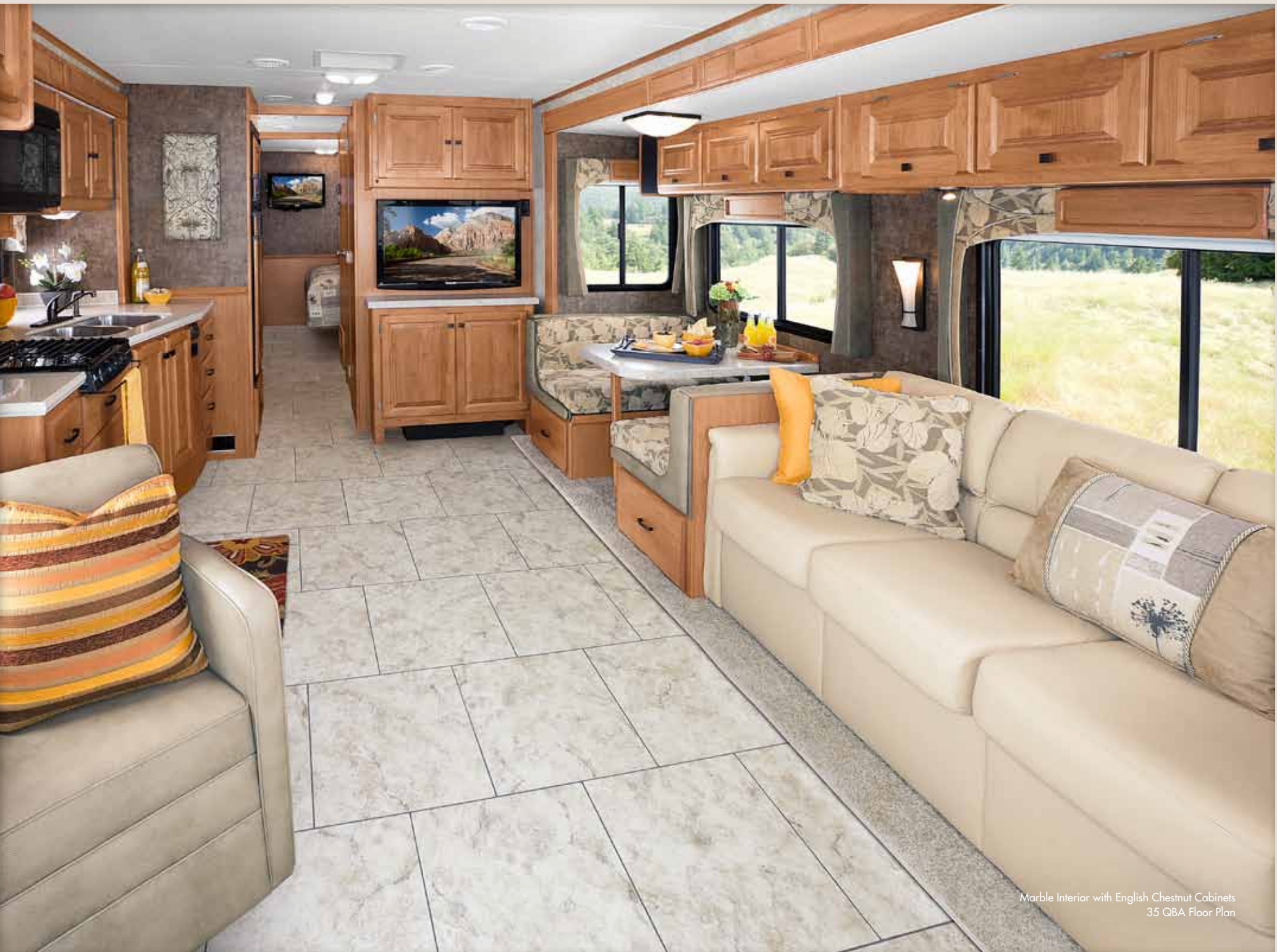
Marble Interior with English Chestnut Cabinets 35 QBA Floor Plan