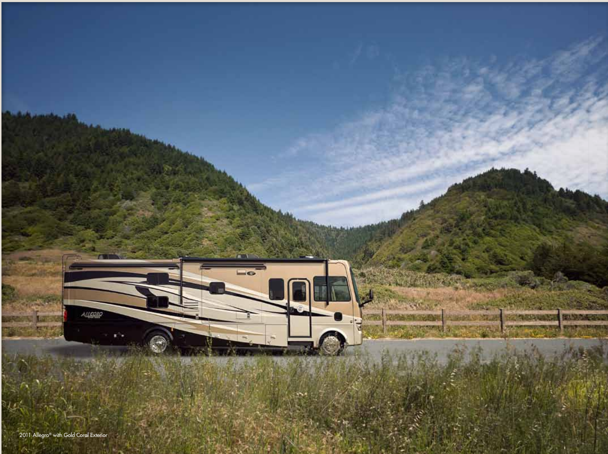
2011 Allegro® with Gold Coral Exterior